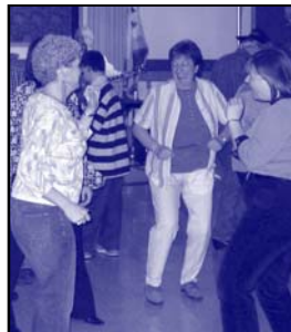
Having a great time and dancing for AROCC

We are looking forward to the 3rd annual Rock N' Roll for AROCC dance to be held on April 21, 2007 . So hold the date and come join us for a night full of fun, and help support our worthy cause.